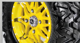
14" Alloy Wheels Customize your Gator UV with these eye-catching wheels. Available in yellow or black.