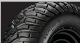
Terra Hawk ATs All terrain and all purpose, excellent handling and low impact on turf. XUV835/ XUV865 Front: 25X9-12, XUV835/ XUV865 Rear: 25X11-12