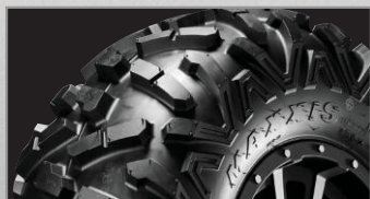
Maxxis BigHorn 2.0 Radials For extreme terrain. Front: 27X9-R14, Rear: 27X11-R14