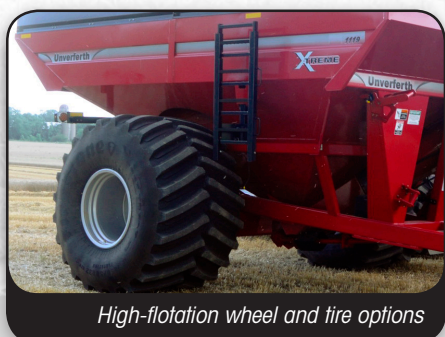
High-flotation wheel and tire options