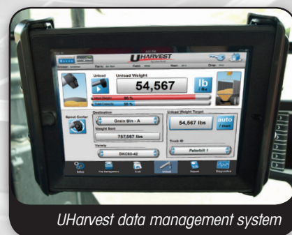
UHarvest data management system