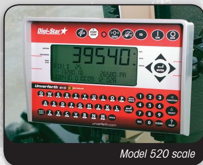
Model 520 scale