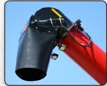
Four-Way Downspout features a funnel design with front/rear rotation and side-to-side maneuverability for precisely controlling grain flow without splatter

All X-TREME grain carts feature a patented auger that allows the upper portion to store diagonally along the front of the cart for extreme auger reach, beyond the cart's hitch. Add in the double flighting in the lower auger with a deep sump and you'll experience extreme unloading efficiency up to 620 bushels per minute.