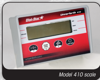
Model 410 scale