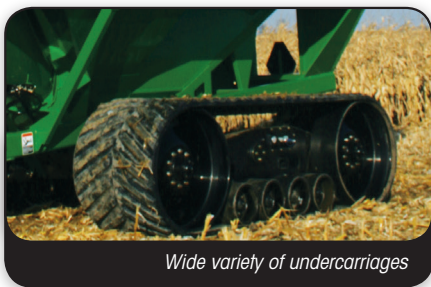
Wide variety of undercarriages

*Capacities measured with #2 corn at 15% moisture, 56# test weight.