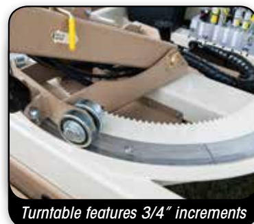
Turntable features 3/4" increments