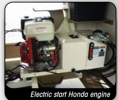
Electric start Honda engine