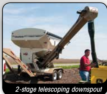
2-stage telescoping downspout