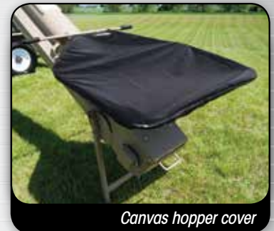
Canvas hopper cover