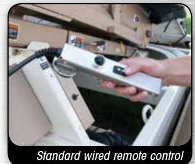
Standard wired remote control

Models 3955XL, 3755XL, 3755, 2755XL, 2755