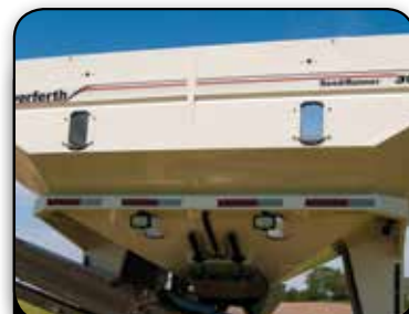
Windows and lights for fill level