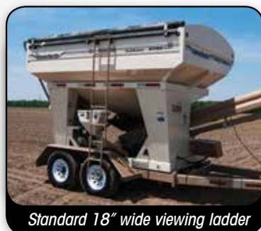
Standard 18" wide viewing ladder