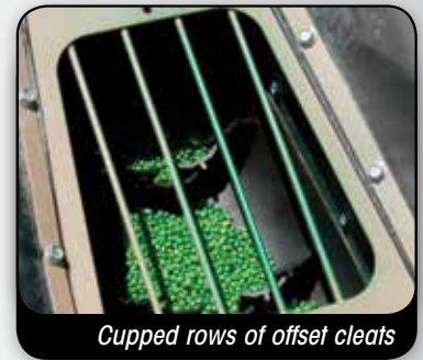
Cupped rows of offset cleats