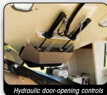
Hydraulic door-opening controls