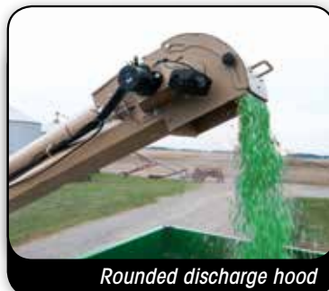
Rounded discharge hood