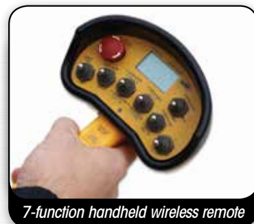
7-function handheld wireless remote