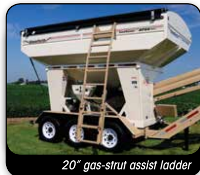
20" gas-strut assist ladder