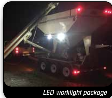
LED worklight package