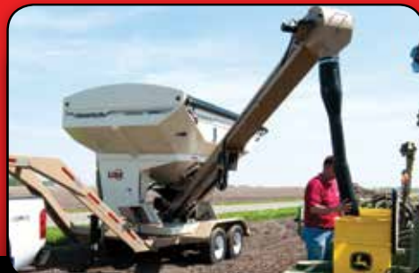
Direct to planter or drill