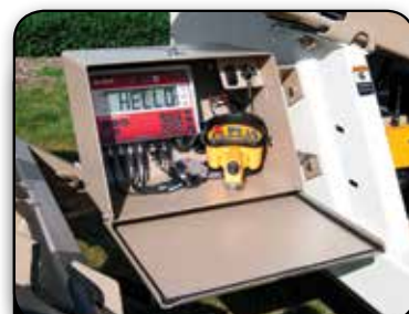
Spacious control console