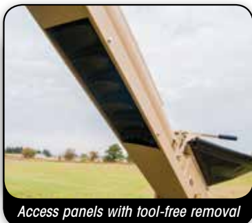
Access panels with tool-free removal