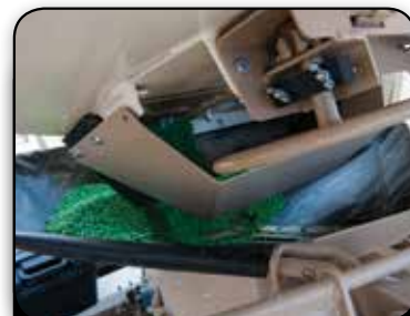
Large door openings